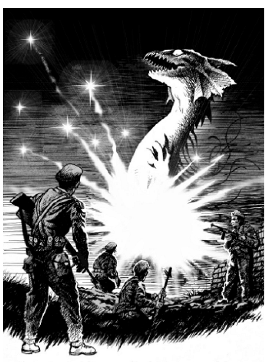
Benton drew back his arm and hurled the bag towards the sea creature. It landed between its legs and then exploded, setting off the biggest fireworks display Smallmarshes was ever likely to see.

Auggi watched her people being massacred on a view-screen within the safety of her cruiser. Beside her lay two dead Earth Reptiles who had dared to suggest that all three of them join the attack. No, she had decided, that was Krugga's job.